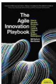
Image Alt Attribute: "How To Develop Products Better Faster And Cheaper In The Modern Marketplace" book cover featuring a modern and innovative product development concept.

Free Download your copy today and unleash the power of accelerated product development!