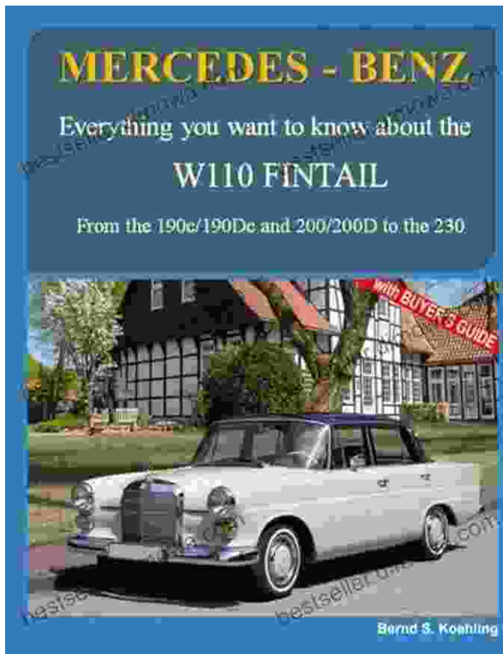
The Luxurious Mercedes-Benz 230

In 1983, Mercedes-Benz introduced the 230 as a more luxurious and spacious alternative to the 190c. Positioned between the compact 190c and the flagship S-Class, the 230 offered a refined blend of performance, comfort, and prestige. It was powered by a powerful 2.3-liter engine and featured an abundance of standard amenities, including leather upholstery, power windows, and air conditioning.