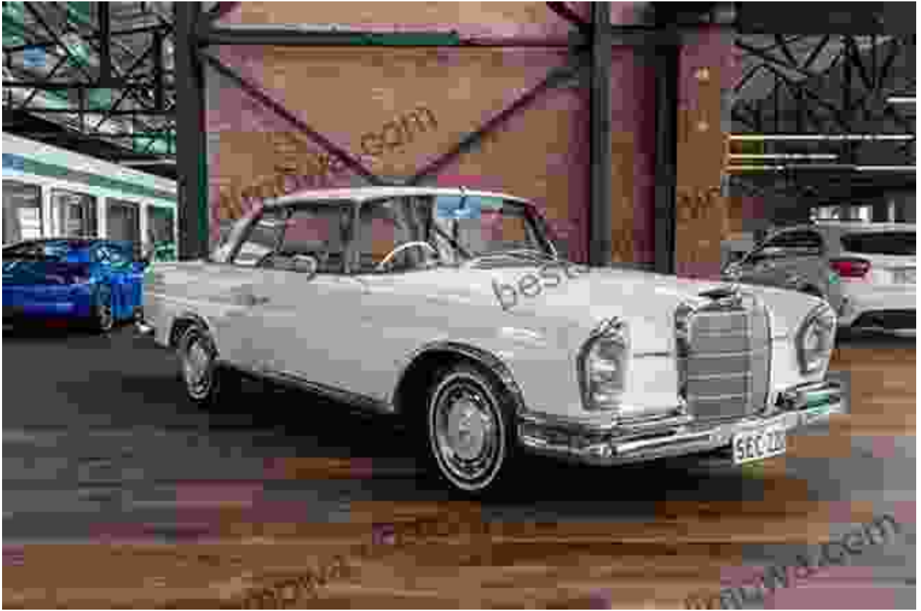
The Pinnacle of Luxury: The 220seb Cabriolet